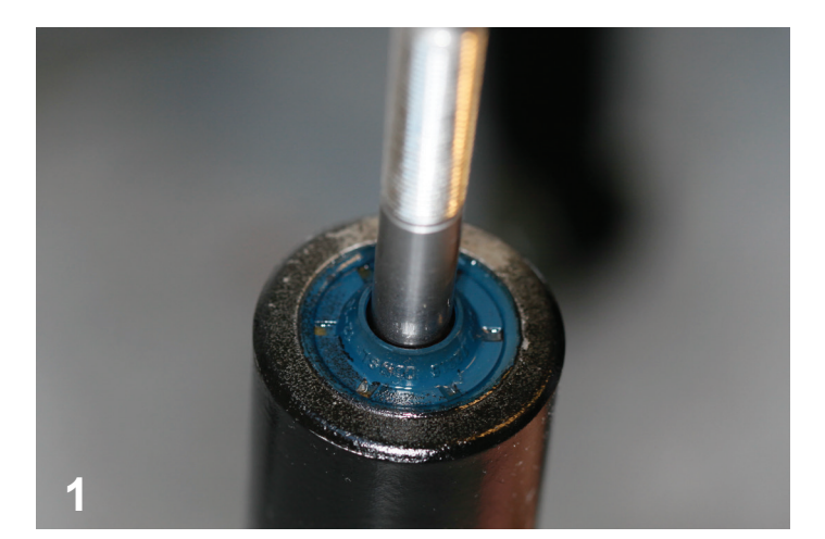
Figure 1 shows an absorber with liquefied assembly grease, but intact seal.

A defect only exists if a larger quantity of fluid escapes and the damping effect is significantly impaired!